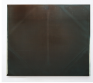
Flare/Black 2016 75 x 87 in Smoke pigment on canvas