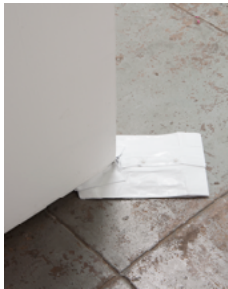
Shim 2018 14 x 9 in Paint on fabric, supporting wall