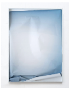
This is That 2017 82 x 60 in Framed C-print, photograph of a spotlight on the wall 1/1