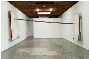
Jack 2018 94 x 215 x 72 in Ceiling jack & stretched paintings on canvas