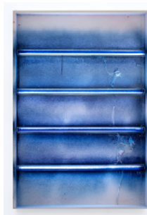
Light Box Exposure 2017 72 x 48 in photo emulsion exposed to light of commercial light box