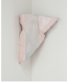
Wedge 2017 13 1/2 x 10 1/2 Paint on foam