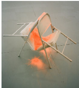
The Good Part 2016 32 x 48 x 18 in metal chair and pigment