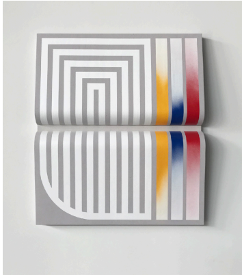
Untitled Gradient 2017 Drop cloth on wooden panel with acrylic paint, tacks & leather hinges 48 x 55 x 5 in