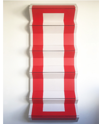
Untitled Red Stack I 2017 Drop cloth on wooden panel with acrylic paint, tacks & leather hinges 90 x 36 x 9 in