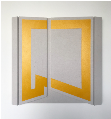
Untitled Yellow Shift 2018 Drop cloth on wooden panel with acrylic paint, tacks & leather hinges 30 x 30.5 x 3.5 in