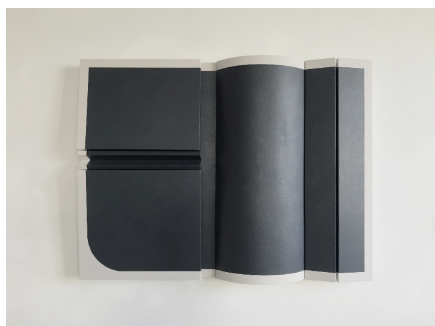
Untitled Black Curve 2018 Drop cloth on wooden panel with acrylic paint, tacks & leather hinges 36 x 48 x 5 in