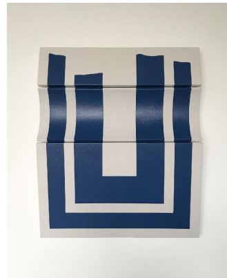
Untitled Concave Blue 2018 Drop cloth on wooden panel with acrylic paint, tacks & leather hinges 28.5 x 24 x 4 in