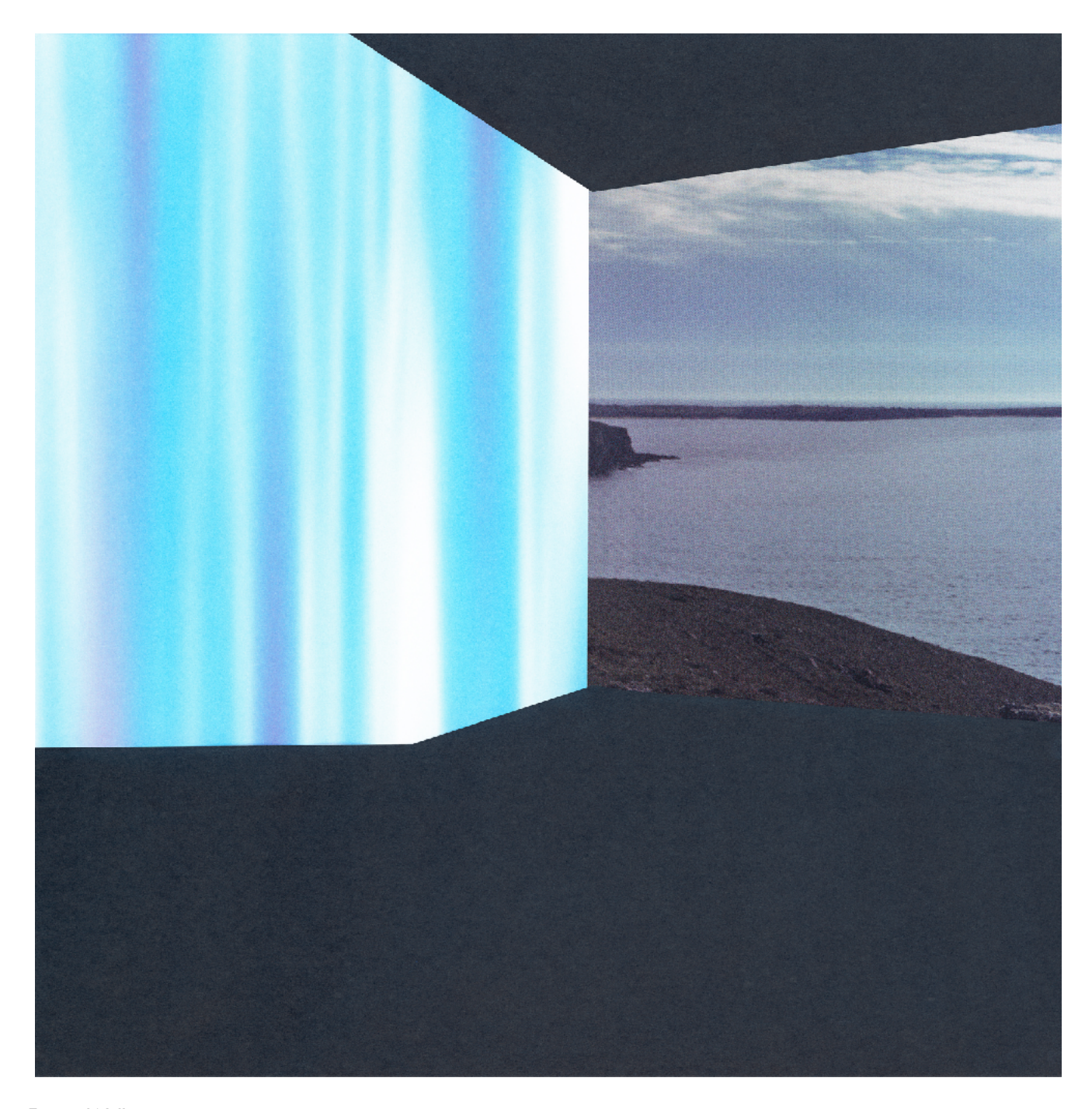
Frozen Wall 2018 self adhesive Orofol #3105HT w/ matte laminate size variable, edition of 3