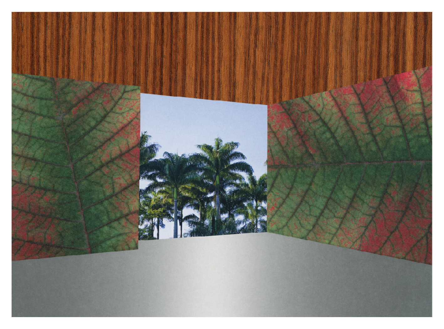
Silver Floor 2018 self adhesive Orofol #3105HT w/ matte laminate size variable, edition of 3