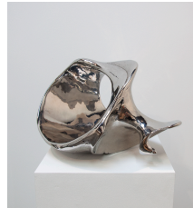
Small Sanctum , 2014 cast stainless steel 13 1/4 x 21 x 14 in edition 1/3