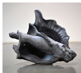
Found Fragment , 2014 cast resin with patina 12 x 24 3/4 x 18 in edition 1/7