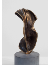
Fragment (original) , 2017 polished bronze 9 x 4 x 3 in (with base) edition 1/4