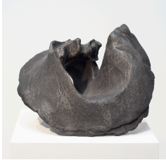
Ascending , 2015 cast resin with patina finish 13 3/4 x 14 1/4 x 18 in edition 1/7