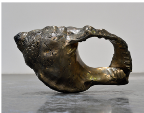
Remnant , 2014 polished bronze 11 1/2 x 28 1/2 x 15 1/4 in edition 1/3