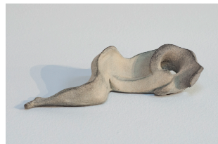
Mother and Child , 2017 patinated bronze 2 x 6 1/4 x 2 1/4 in