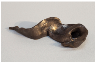
Mother and Child , 2017 polished bronze 2 x 6 1/4 x 2 1/4 in