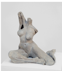
Returned , 2014 cast resin with patina 14 x 12 3/4 x 8 1/2 in edition 1/5