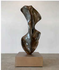
Fragment (enlarged) , 2018 silver nitrate patinated bronze 61 x 24 x 20 in edition 1/3